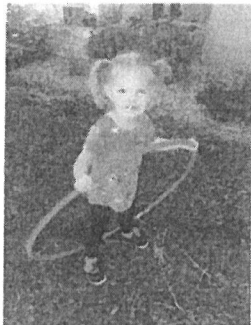
Box and Bubble Day

I approached four homeschool families and asked them if I could help them create and implement a co-op to meet at the Library. They said, “Yes, please!” I will be ordering (free) STEM trunks full of activities from the State Library for them to use during their meetings.